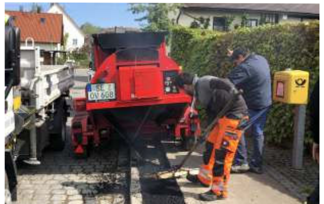
Patent Application Publication Nov. 13, 2003 Sheet 1 of 2 US 2003/0211438

These high axial segments, fixed inside of the mixing drum, are preventing the premature escape of heat and ensure the absorption. The broken asphalt lumps warm up while passing the segments and reaching the heating section as small fines. In the heating section the material is heated up by radiant heat, but mainly by the hot wall of the mixing drum. After 10 minutes of heating the discharging gate is to be opened. Depending on the material and with continuous loading the output of the Asphalt Recycler BA 7000 F is up to 7t/h and the BA 10000 F up to 10t/h.